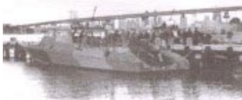
MK5 Special Operations Craft