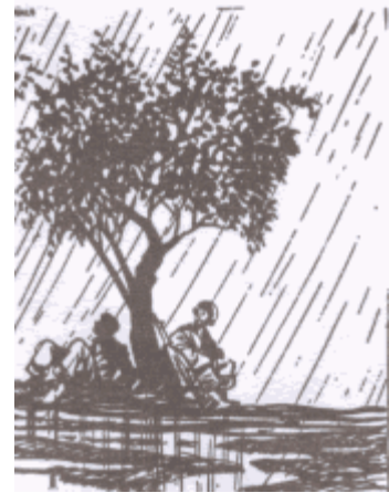
Hey, this damn tree leaks!

If you think you might have a problem, contact your health care provider and discuss your situation with them, only a sleep study can tell.