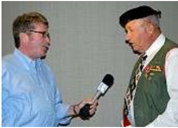
Coop being interviewed by the reporter.